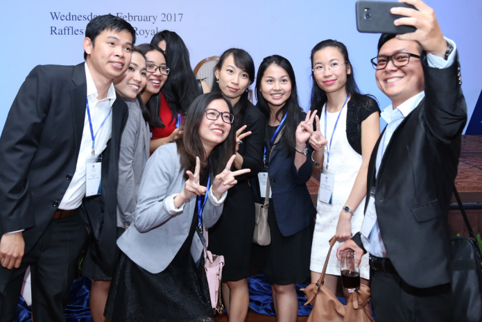
Australia Awards Alumni enjoying their welcome home event

Launch of Intake 2018 & Welcome Back Returning Graduates